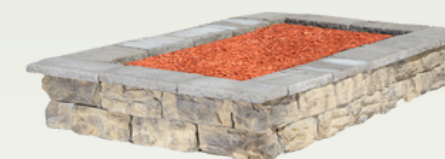
SHOWN: FOSSILL LIMESTONE