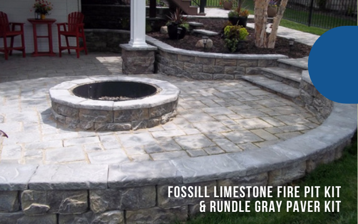
FOSSILL LIMESTONE FIRE PIT KIT & RUNDLE GRAY PAVER KIT

Offered in Fossil Stone and Random Stone colors and profiles. Visit NCPOutdoor.com for special order details, freight, and estimated delivery.