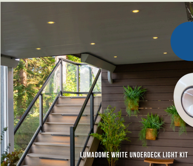
LUMADOME WHITE UNDERDECK LIGHT KIT