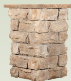
SHOWN: FOSSILL BROWN