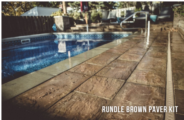
RUNDLE BROWN PAVER KIT