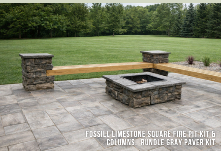
FOSSILL LIMESTONE SQUARE FIRE PIT KIT & COLUMNS, RUNDLE GRAY PAVER KIT