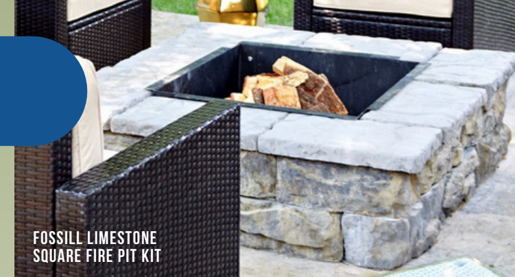
FOSSILL LIMESTONE SQUARE FIRE PIT KIT