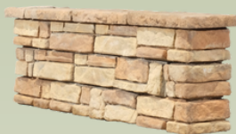
SHOWN: RANDOM BROWN