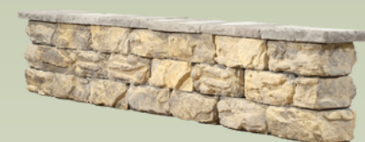
SHOWN: FOSSILL LIMESTONE