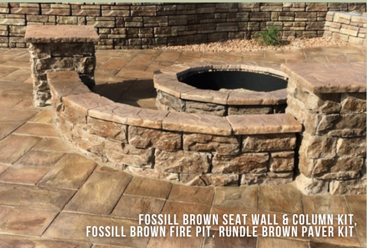
FOSSILL BROWN SEAT WALL & COLUMN KIT, FOSSILL BROWN FIRE PIT, RUNDLE BROWN PAVER KIT