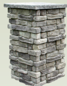
SHOWN: RANDOM GRAY