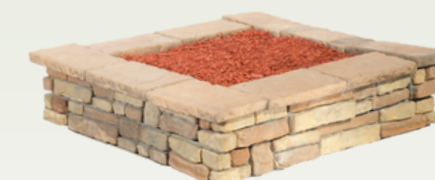
SHOWN: RANDOM BROWN