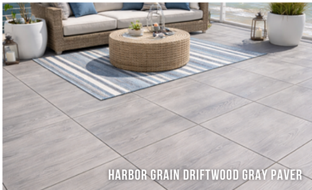
HARBOR GRAIN DRIFTWOOD GRAY PAVER