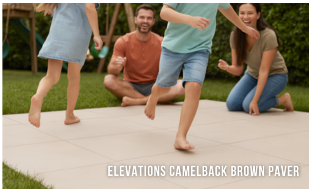
ELEVATIONS CAMELBACK BROWN PAVER