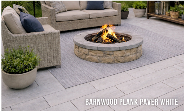
BARNWOOD PLANK PAVER WHITE